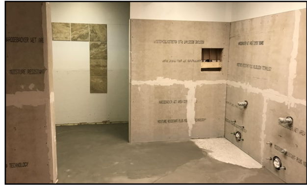
The ladies' locker room