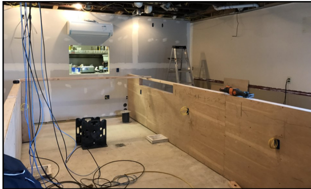
The Tern Grille

As we gear up for the season, we'll gradually increase both our inside and outside staff. There will be many returning faces as well as