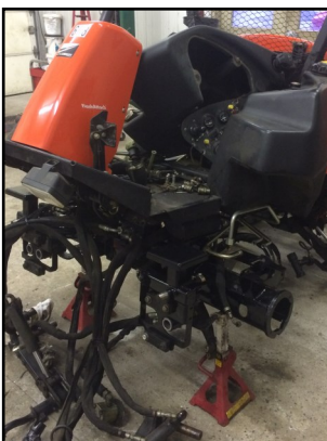
A fairway mower under repair

We're in full winter mode now. The maintenance crew and Jeff, our equipment technician, are in the process of going through all of the equipment to make any needed repairs and to ensure that it's ready for the upcoming season.