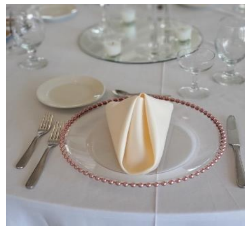
Pearl Charger- $3 each