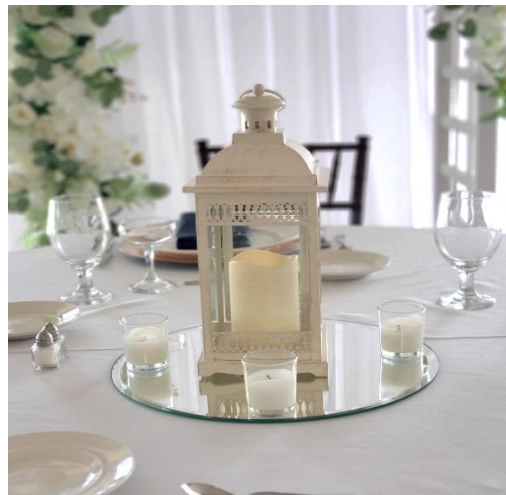
Lantern- $30 each