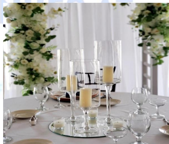
Set of 3 candle holders- $35 each